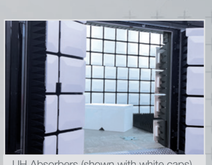
UH Absorbers (shown with white caps) in a Fully Compliant 3m chamber