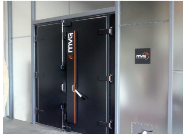
Example of double leaf manual swing door

MVG shielded doors, manufactured to the same high quality as our shielded rooms, are an excellent match for any high performance shielding system. The doors are available in manual, semi- and fully automatic operation, for both swing and sliding door designs. See the Shielded Door datasheet for more information.