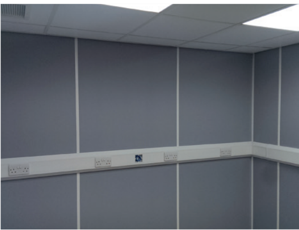
Shielded room lined with acoustic panels

Alternatively, either type of room can be lined with decorative wall linings and/or a suspended ceiling. For the decorative wall linings this could be a plasterboard finish or an acoustic panels.