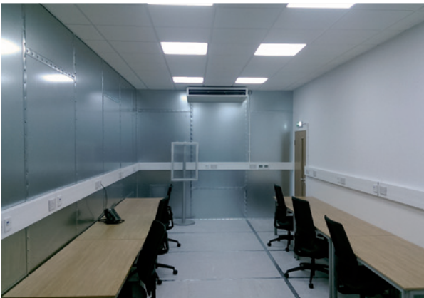
Sandwich panel room with one wall left bare, one wall with plasterboard linings and a suspended ceiling