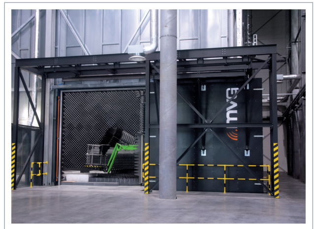
Example of a test chamber with door open