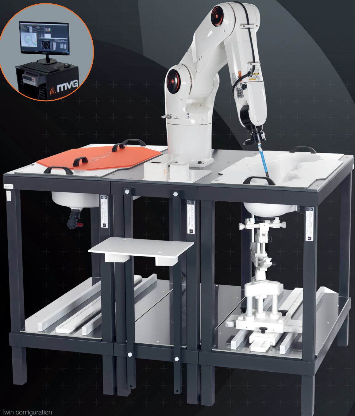
ComoSAR Twin configuration