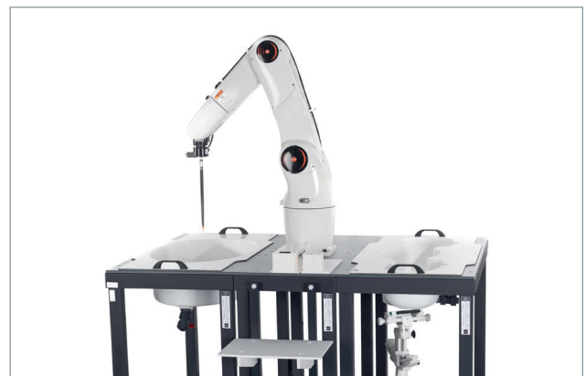
ComoSAR Twin configuration

© MVG 2024 - DT.119.1.16.MWLB - Graphic design: www.atelemaupoux.com, pictures: all rights reserved. Product specifications and descriptions in this document are subject to change without notice. Actual products may differ in appearance from images shown.